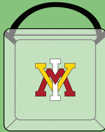
12" x 6" x 12"