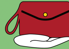
4.5" x 6.5"