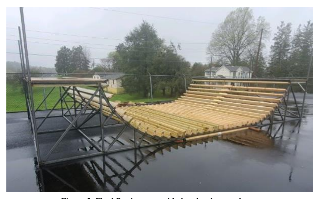
Figure 2. Final Product assembled at the skate park