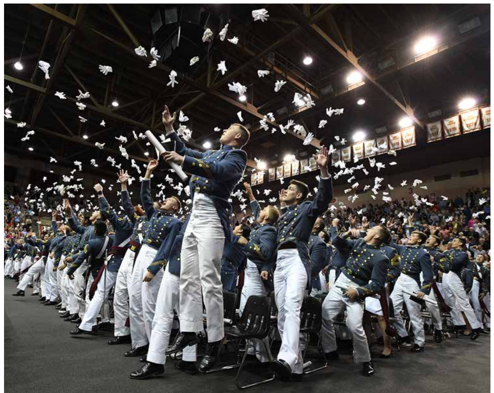
Members of the Class of 2022 toss their gloves in the air after being dismissed from duty and finishing their tenure at VMI.

Financial literacy is an important part of understanding financial aid, personal finances, and debt management for cadets. VMI strives to educate and prepare cadets with tools and resources to help build their money management skills. From educated choices on student loan amounts to sustainable payment plans, VMI is here to provide guidance on the path to pay for college.