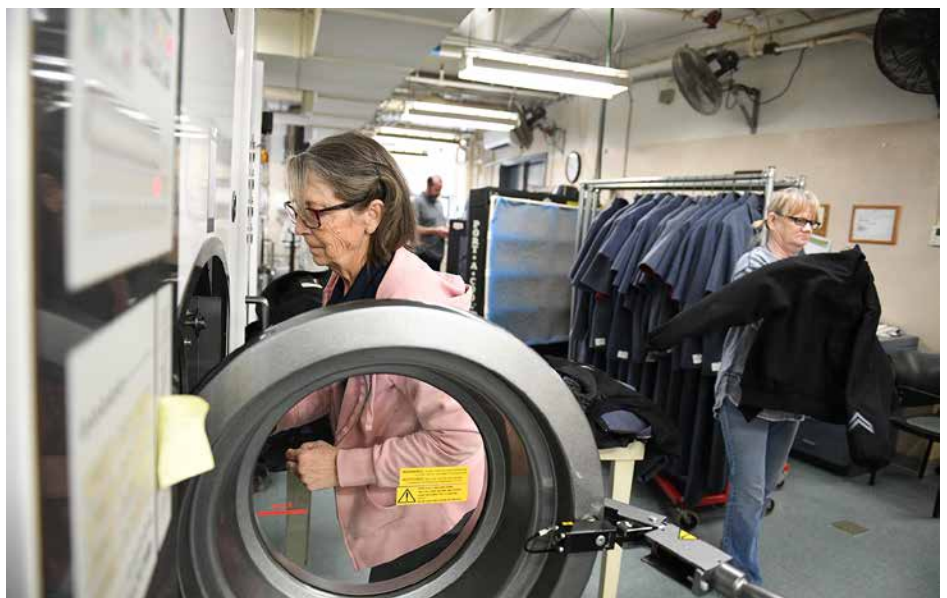
Employees in the laundry department help keep the Corps of Cadets looking their best.

post. Shuttle services from post to the Lackey Park lot are available. Parents are reminded that parking fines and penalties for unauthorized vehicles or non-registered cadet vehicles are strictly enforced. Also strictly enforced will be the 15-mile-per-hour postwide speed limit and parking in unauthorized spaces generally marked by yellow stripes. Exceptions are made for major conferences and Corps events.