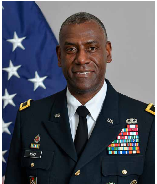
Maj. Gen. Cedric T. Wins '85

During the 2022–23 academic year, VMI will engage in an inclusive process to develop a new strategic plan that keeps in mind these five key outcomes while building on the solid foundation and successes of the Institute's current strategic plan, Vision 2039. The new strategic plan will guide the Institute as we continue to work to optimize conditions for academic success, advance and modernize new and existing academic