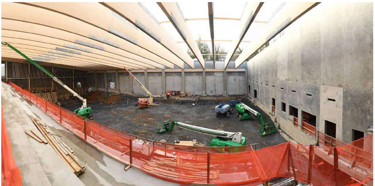
The final roof beams of the Aquatic Center were placed in March 2022.

The renovation of the Superintendent's Quarters at 412 Parade, the most comprehensive in more than 25 years, includes updates to the historic home's electrical, mechanical, and plumbing systems, plus painting and other home maintenance tasks. The house will be accessible for those with mobility challenges. A ramp will be built from the sidewalk to a side door, and a first-floor bathroom will comply with current accessibility requirements. Because the Superintendent's Quarters is one of the oldest buildings on post, and is listed both as a National Register property and as a National Historic Landmark, its renovation has been undertaken in consultation with architectural historians at the Virginia Department of Historic Resources. Cadets, faculty, staff, and other guests are welcomed to the home for special events throughout the academic year.