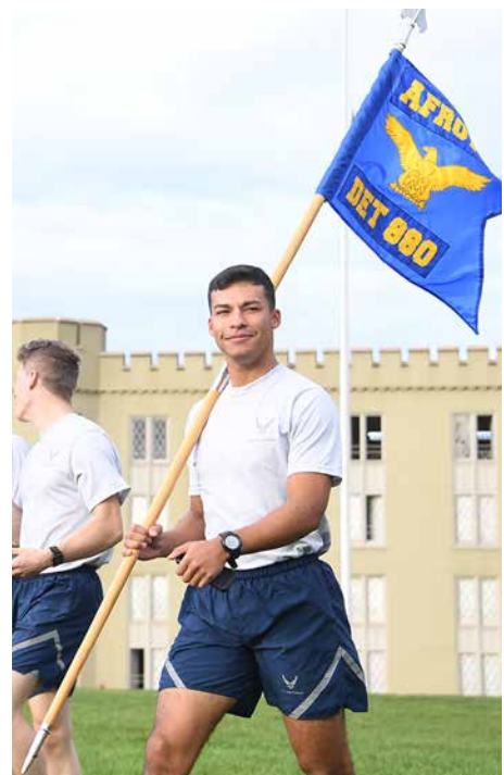
Air Force cadets participate in activities on the Parade Ground for fall field training exercises in October 2021.

Air Force ROTC now has both 2-D and virtual reality flight simulators, which can help prospective pilots decide if a pilot slot is the right fit for them. In addition, Air Force ROTC cadets have the opportunity to fly with the