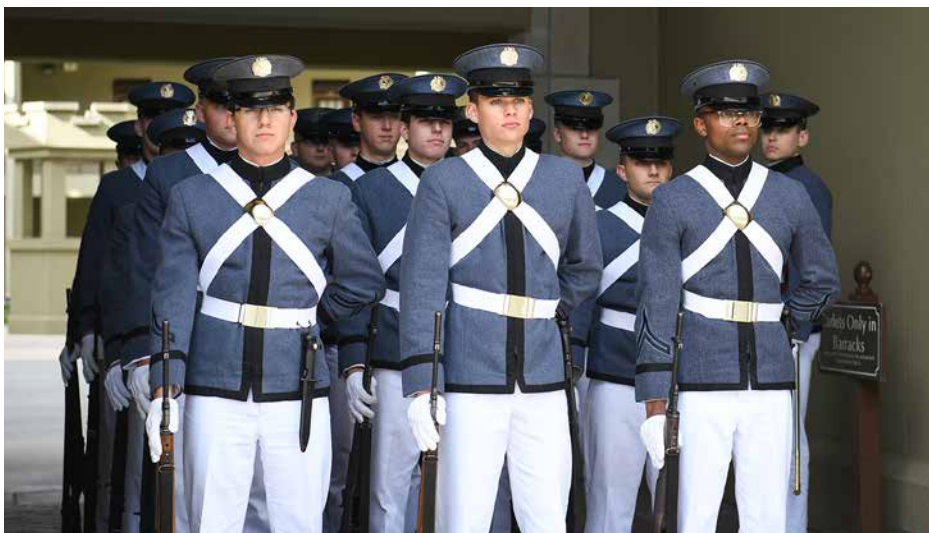
Cadets participate in a changing of the guard ceremony in April 2022.

on substance use/abuse prevention to increase cadets' awareness of the dangers of alcohol abuse. Cadets caught with alcohol in barracks are automatically referred for substance abuse education offered by the counseling center. Though strict rules, stiff penalties, and constant briefings deter most cadets from serious alcohol incidents both on and off post, parents should remind cadets of the risks associated with infractions of these rules. Disciplinary actions following a first violation, either on or off post, include several months of confinement, many hours of marching, demerits, and conduct probation. Cadets involved in two alcohol-related offenses are eligible for suspension. A third offense may result in suspension. Without parental support, VMI cannot prevent underage drinking and alcohol abuse. Parents are urged not to make local houses available to cadets as locations for parties or to make alcohol available to underage cadets or to any cadet in violation of Institute regulations. This includes tailgating, where alcohol is prohibited for everyone. VMI maintains a zero-tolerance stance in regard to the illegal use of drugs. The use of illegal drugs and the illegal use of prescription medications by cadets will normally result in automatic dismissal. General Order 53, Policy on Prohibiting Controlled Substances and