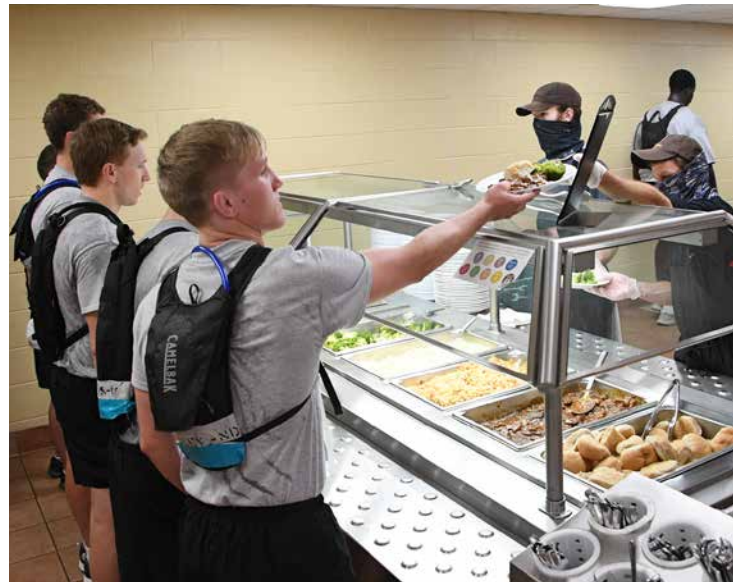
Matriculants get food in Crozet Hall during Matriculation Week.

emphasizes fresh, locally sourced ingredients. Crozet Hall offers gluten-free and allergen-free options for cadets, along with vegetarian fare. Proper nutrition is vital for all cadets, but especially for new cadets, who are adjusting to the rigors of the Rat Line, while also adjusting to the physical challenges of military training and the intense demands of college-level academics. Parents should encourage their