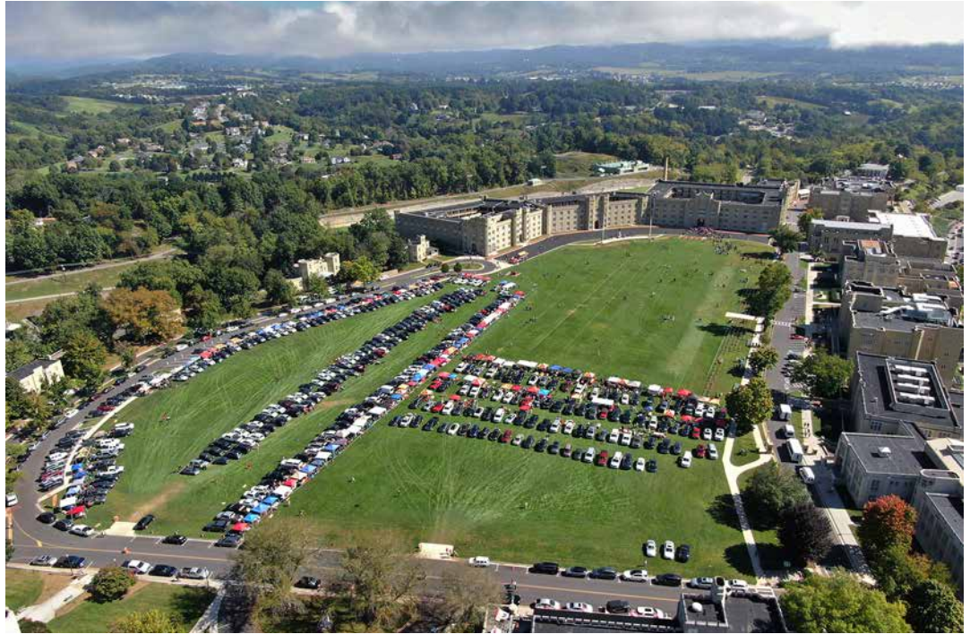
Cars are lined up on the Parade Ground during a Fall 2021 football game for tailgating.

The Corps of Cadets marches in full parade on many Friday afternoons and certain Saturday mornings during the school year. These parades—military reviews of the cadet regiment by the superintendent—are open to the public and display the level of discipline, order, and uniformity the cadets train hard to achieve. Visitors can witness one of the longest-held traditions at VMI on most Friday afternoons at 4:35 and select Saturday mornings at 10:30. For the full schedule of parades, check the calendar at www.vmi.edu .