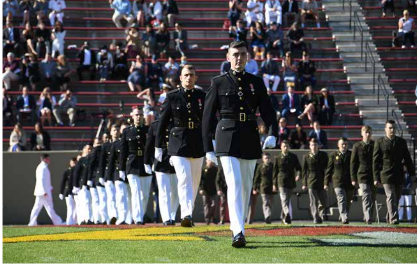
Cadets process into Foster Stadium for the Joint Commissioning Ceremony May 15, 2021.

select an ROTC unit, only to discover some time later that they would prefer to be part of another. Cadets wishing to switch from one ROTC unit to another should make their wishes known as early in their cadetships as possible.