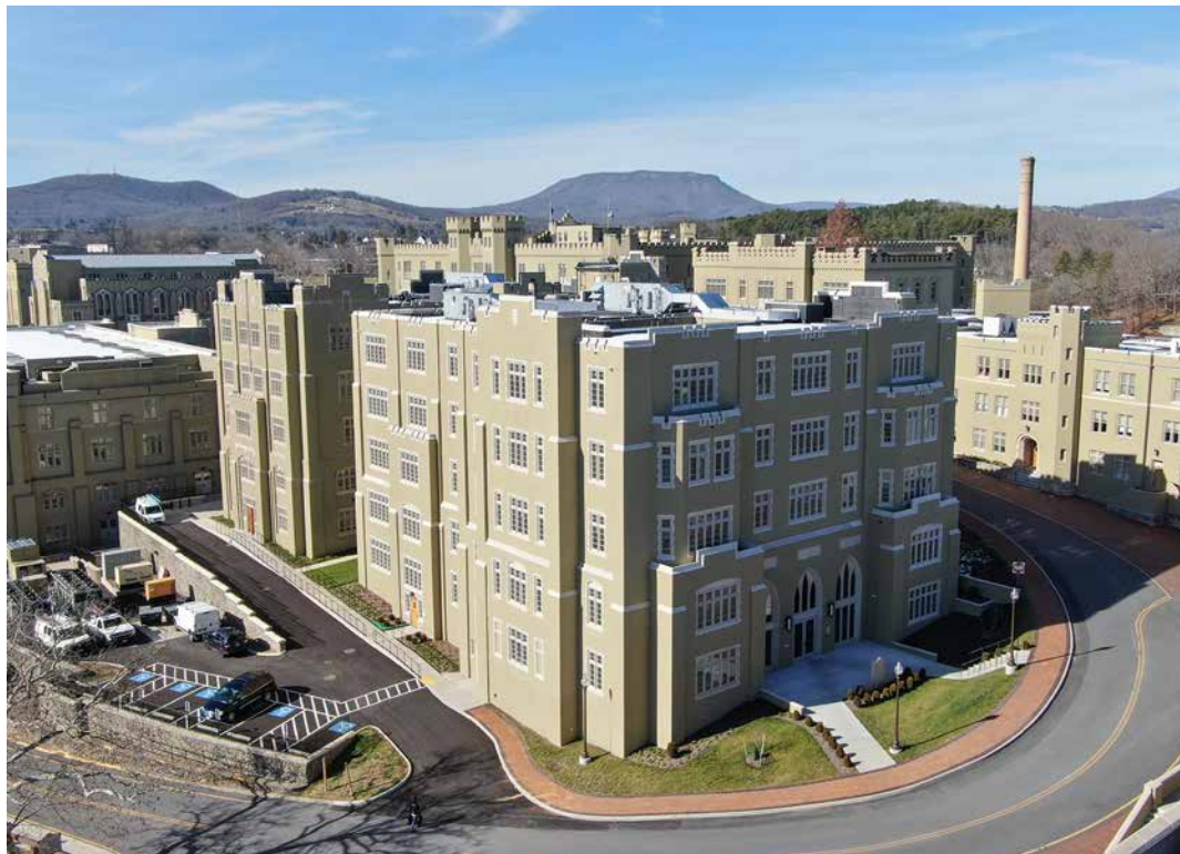
An aerial view of Scott Shipp Hall shows the new addition to the building.

Barracks safety will also be improved in coming years with the replacement of exterior doors and hardware, the replacement of windows and window frames in portions of barracks, an upgraded camera system, and updates to the technology within barracks. The plan is for these projects to begin in 2023.