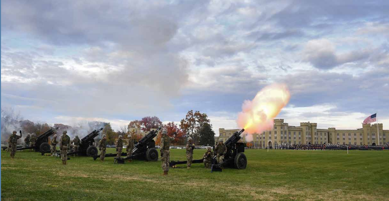
Front cover and back cover—VMI Photos by Eric Moore and Kelly Nye.