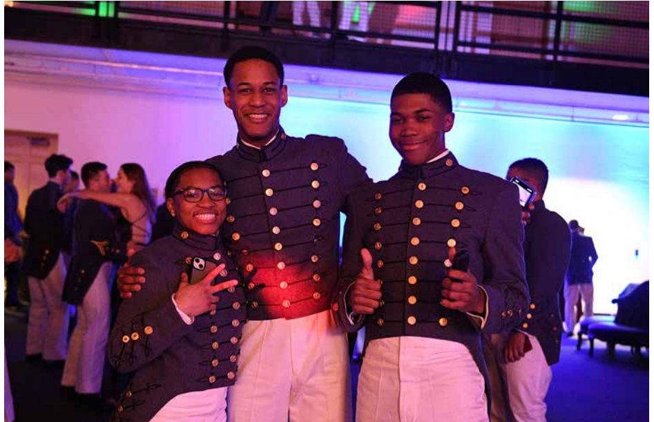
Cadets take a break from dancing to pose for a photo during the Midwinter Formal in February 2022.

VMI restricts most cadet use of automobiles, and the Institute expects consistent and continued parental support for these policies. Only 1 st Class cadets with full class privileges are authorized to register, maintain, and operate a motor vehicle in Rockbridge County. However, 2 nd and 3 rd Class cadets who are active members of drilling Reserve