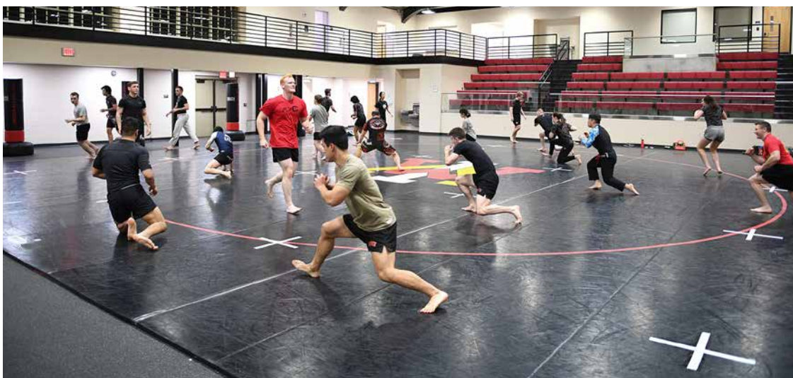
The VMI Jiu Jitsu club team practices with the team from Virginia Tech in February 2022.

faith-based fellowships and meetings take place each week. The chaplain's office also provides opportunities for mission trips, conferences, and retreats for various faith groups throughout the course of the academic year. Above all, the chaplain's office works to accommodate the religious needs of all cadets and provides pastoral care and mentoring, regardless of religious affiliation.