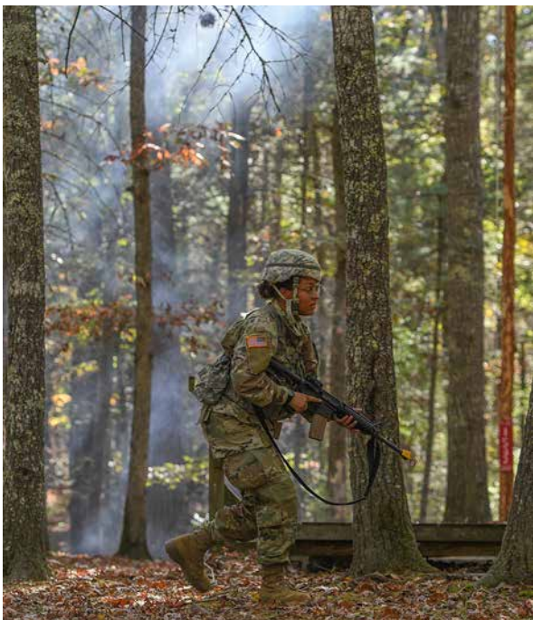
An Army ROTC cadet participates in fall field training exercises in the woods of the Goshen Boy Scout Camp in October 2021.

Recently, the Air Force has been granting fewer scholarships to college students, although this change has not affected the number of scholarships granted to high school students. High school seniors and 3 rd and 4 th Class cadets must meet minimum score requirements on the SAT and ACT. All applicants for an Air Force ROTC scholarship must have at least a 3.0 grade point average, though the SAT scores lower from 1240 for high school scholarships to 1100 for in-college scholarships. ACT drops from 26 in high school to 22 in college. Scholarship applicants should be aware that there is a national competition for scholarship money. Factors determining the awarding of scholarships include commander's ranking, physical fitness, and grade point average. Parents should be aware that the AFROTC scholarships cover the full amount of tuition at VMI, but none cover the cost of room and board. The Space Force is now offering scholarships for high school seniors only. Graduating seniors that commission incur a 4-year active duty service commitment in either the Air Force or Space Force.