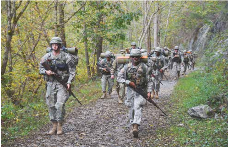
Cadets from all four classes participated in Army ROTC fall FTX Oct. 21-23, which for 4 th and 3 rd class cadets started off with a ruck march to McKethan Park on the Chessie Nature Trail.

They describe their work together as "seamless."