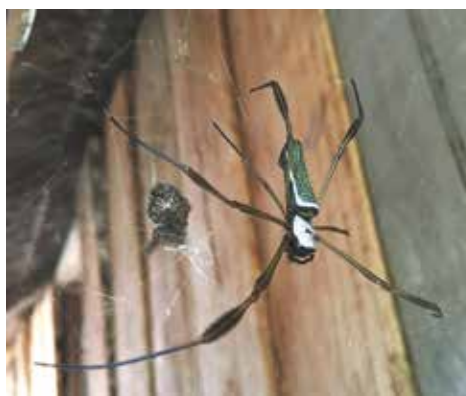
Spiders and their webs are valued by the Quichua for their role in controlling mosquitoes and, thus, malaria.