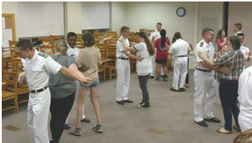
Members of the Ballroom Dance Club practice their steps in Scott Shipp Hall earlier this semester.