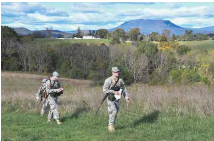
Cadets navigate around McKethan Park during Army ROTC field training exercises.

Once the science of leadership is learned, he noted, the cadets must have the maturity to apply it as an art form. VMI's Army ROTC program offers training and experience to achieve both.