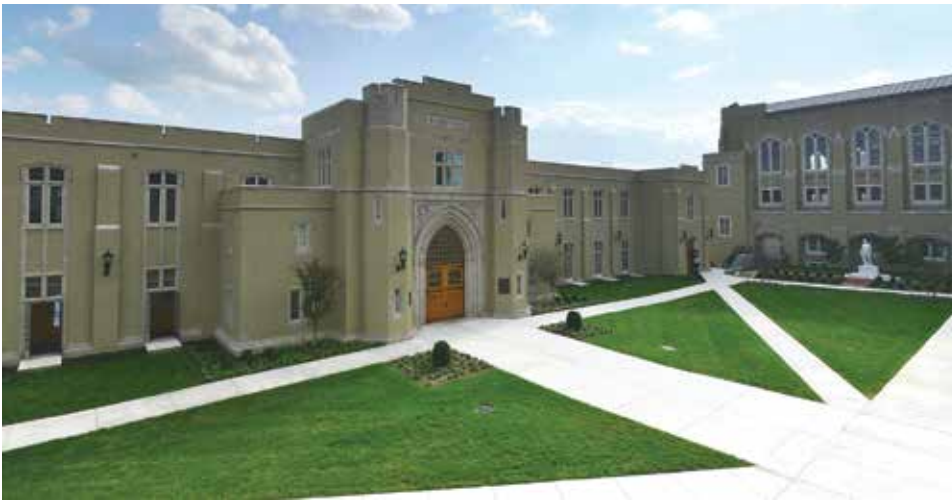
New exterior surfaces and a restored Memorial Garden mark the newly reopened Cocke Hall.

Despite the many changes, the building retains its classic feel. The layout of the ground-level courts and upper-level track remain largely unchanged, but both were upgraded with new flooring.