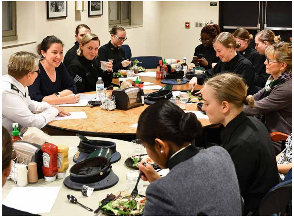
The women’s focus group meets for a meal and to learn more about the Building BRIDGES community service group Feb. 26 in Crozet Hall.