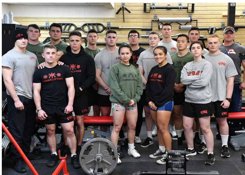
The powerlifting team poses during a February practice.

The team is now preparing for the 2020 USAPL Collegiate Nationals that are being held at Pennsylvania State University in April. 🌟