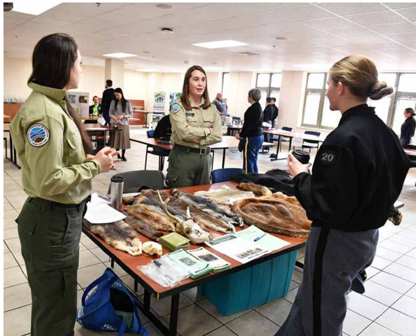
The Natural Bridge State Park was among many community organizations represented at the Service Fair, held in Crozet Hall.

Among the community organizations represented at the fair were Hoofbeats, an organization providing therapeutic horseback