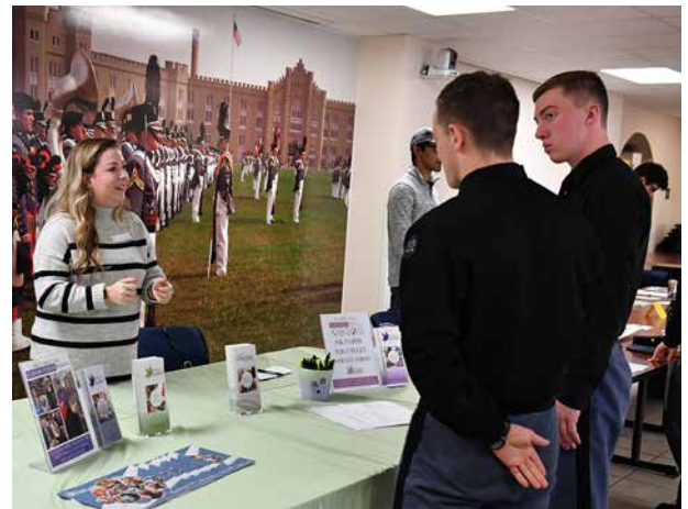
Cadets speak with a representative of Rockbridge Area Hospice during the Service Fair.