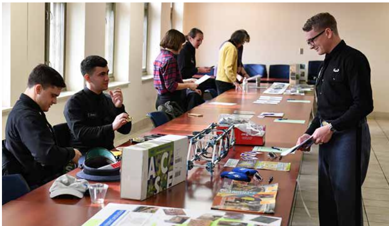
The VMI chapter of the American Society of Civil Engineers was on hand at the Service Fair.