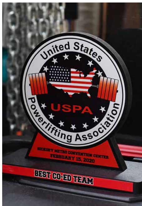
This is one of the many recognitions of the VMI powerlifting team.