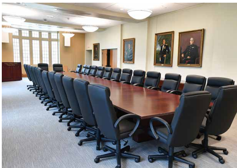
The Turman Room now has conference-style seating and will be used as a classroom this fall.

The library's top three floors—the seventh, sixth, and fifth—are all complete. On the floors below, work is ongoing, with the goal of completion by Thanksgiving.