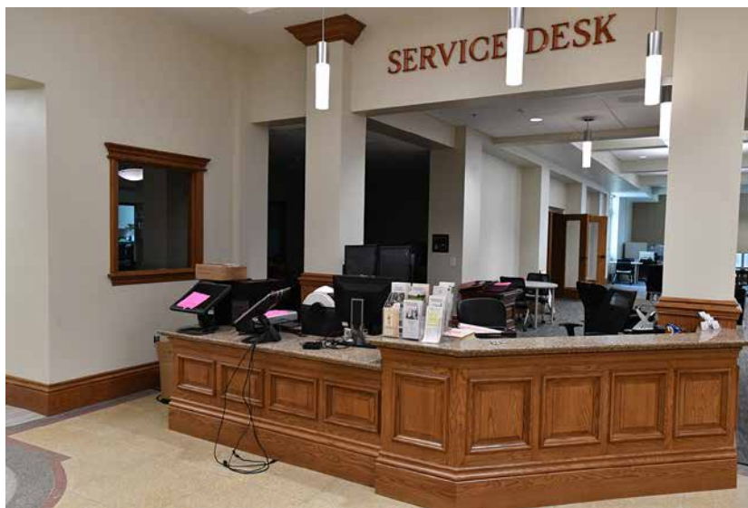
The Preston Library service desk now features a self-checkout system.

Likewise, the seventh floor of the library, once inaccessible by elevator, is now accessible. That floor, formerly home to the Mathematics Education