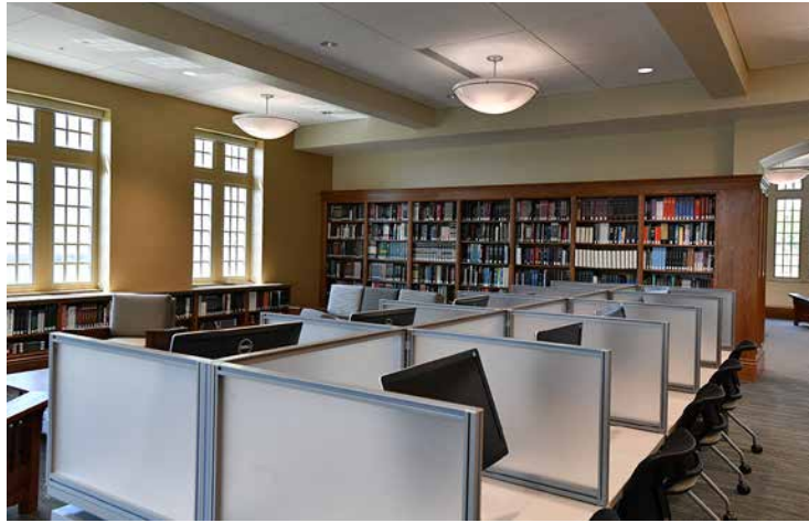
The learning commons on the fifth floor of the library features many computers for cadet use.

There's another new feature for library users as well—print release technology. In years past, cadets seeking to use the library's printers often hit “print” on their computers even if the printer in question was out of paper or otherwise out of service. There's also been instances in which a cadet has picked up another cadet's paper off the printer by accident.