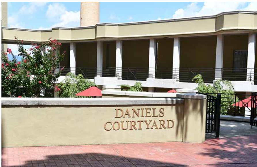
The Daniels Courtyard offers a quiet space for cadets to study or relax outdoors.