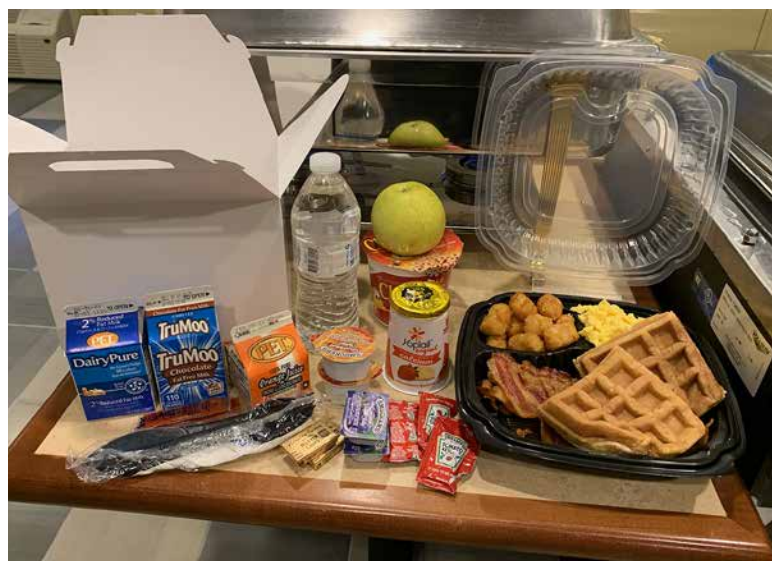
Cadets receive packaged meals and snacks like this one from Parkhurst Dining.