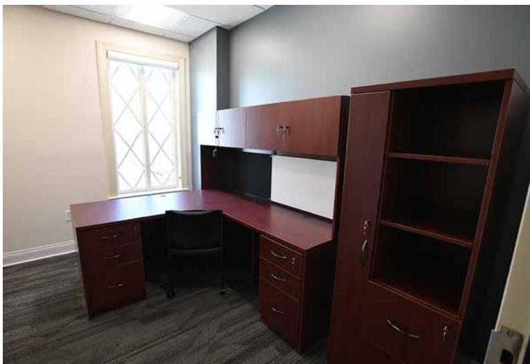
Office furniture arrives at its new home in the final moving stages for the VMI Police in early February.