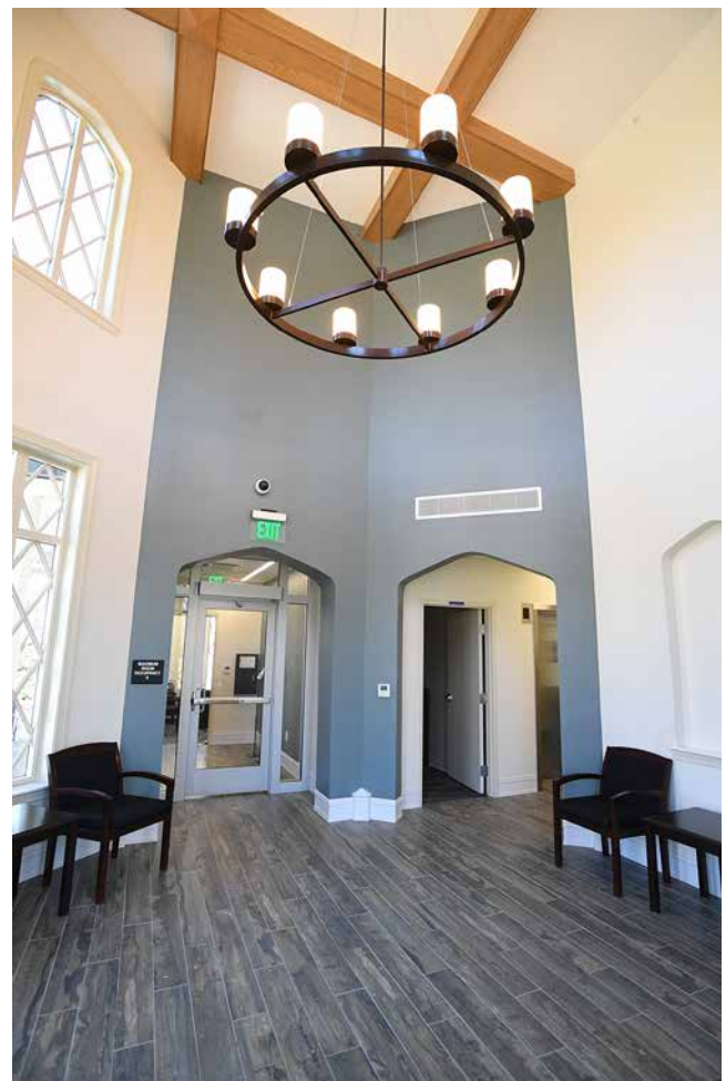
The atrium of the new VMI Police building features custom windows that match VMI’s architectural style.