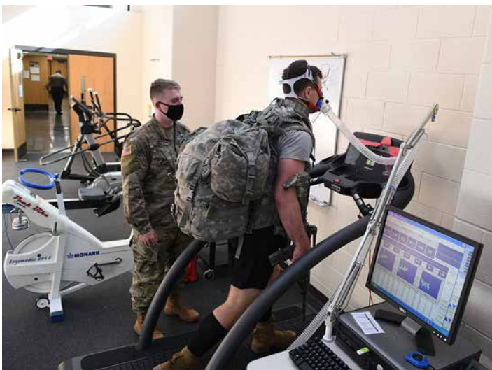
Participants in the load carriage study carry 55% of their body weight while simulating a ruck on the treadmill.

The only obstacle is COVID-19. The outbreak among cadets will push the study to later this summer or fall.