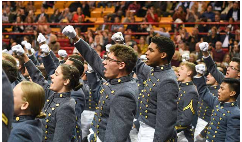
Cadets sing "The VMI Spirit" in Cameron Hall after receiving their rings Nov. 19.