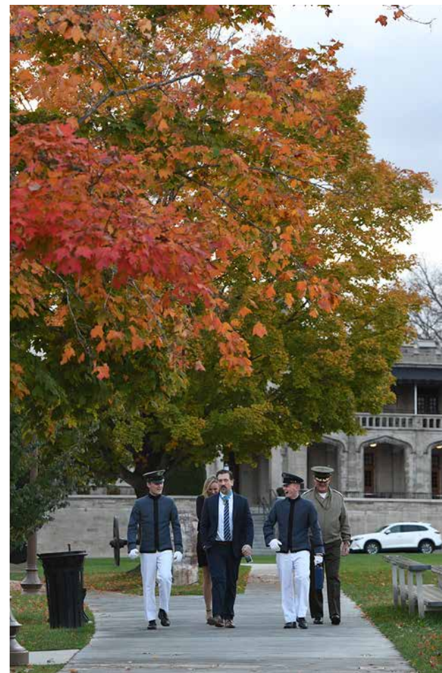
Retired Staff Sgt. David Bellavia tours post with cadets during his visit Nov. 2.

Accountability, loyalty, and consistency are critical character traits required while serving in the military, but also in the civilian world. It is important to lead by example for what it means to be a good citizen and a