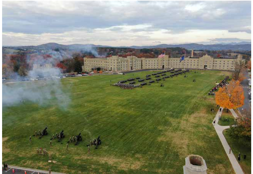
The Cadet Battery finishes firing the howitzers during the Founders Day parade Nov. 11.