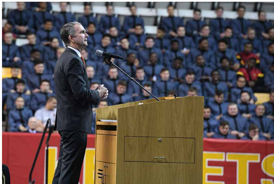
Gov. Ralph Northam '81 speaks of his time as a cadet at VMI during his address to the Corps in Cameron Hall Nov. 15.

Cadets will be prepared for their next ventures, whether in the military or private sector. With Virginia's high rankings in