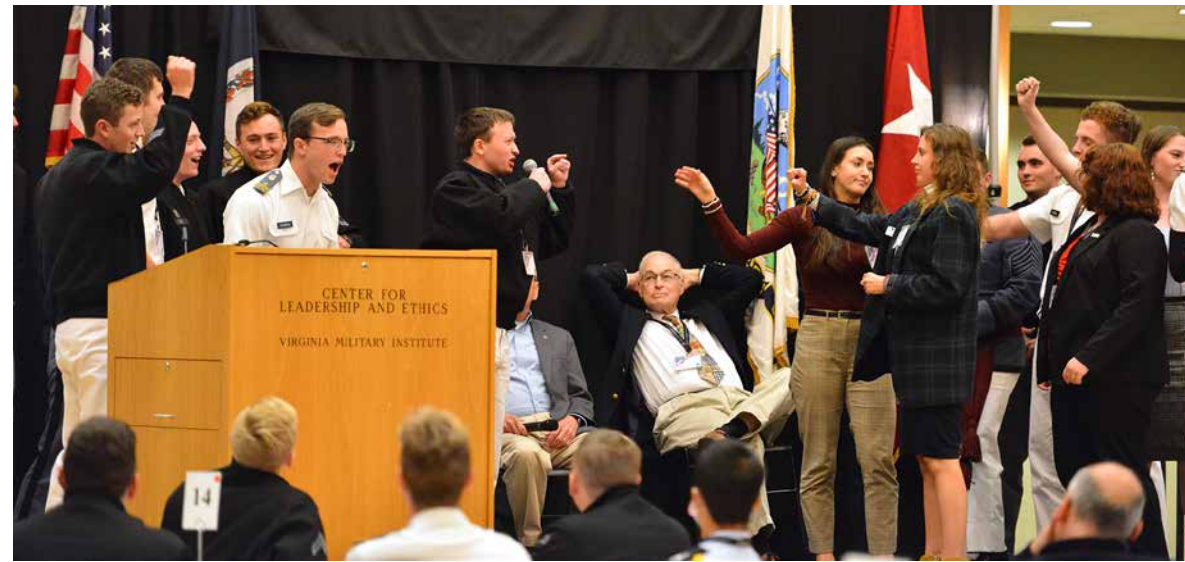
Leadership Conference participants perform a skit acting out a civil debate on a controversial topic in the Hall of Valor Nov. 2.

The first guest speaker the audience heard from was Amy Chua,