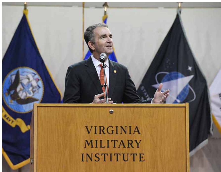
Gov. Ralph Northam '81 addresses the Corps of Cadets in Cameron Hall Nov. 15.

He then joined faculty, staff, and the entire Corps of Cadets in Cameron Hall