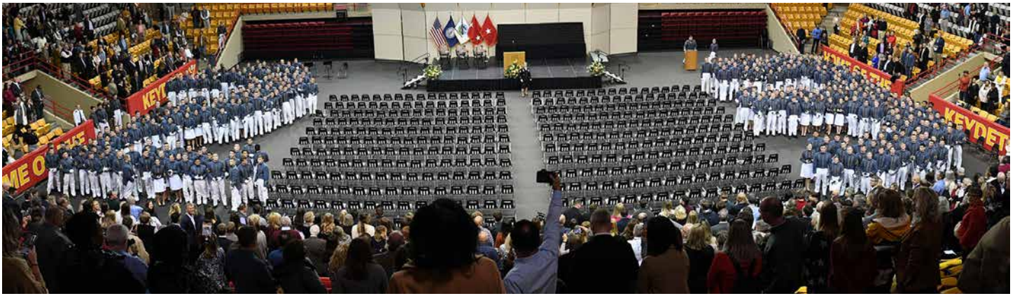
The Class of 2023 form the figure two and the figure three on the floor of Cameron Hall after receiving their rings Nov. 19.