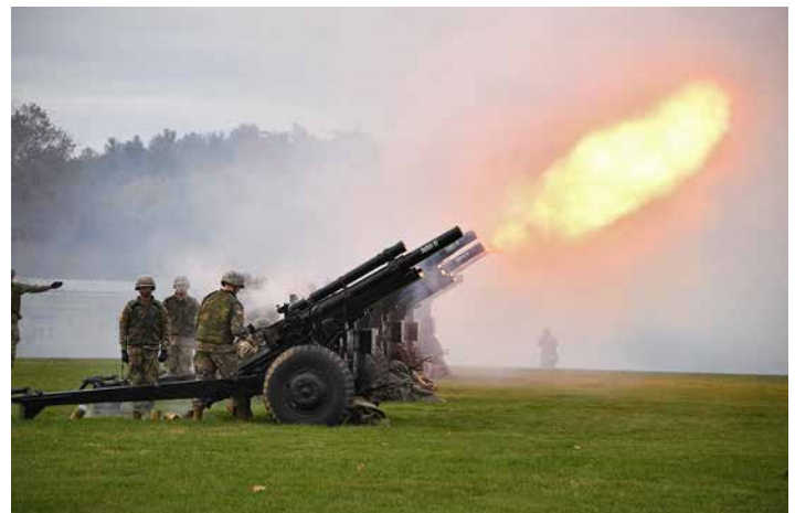
The Cadet Battery fires the howitzers during the Founders Day parade Nov. 11.