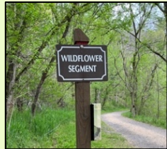
The stretch of Trail from Mill's Creek to Reid's Lock and Dam is known for an abundance and diversity of wildflowers.