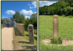
Old railway markers alerted C&O engineers to the distance in miles to Balcony Falls, and when to blow the whistle. New markers are posted every half-mile heading east from Lexington to Mile 4.