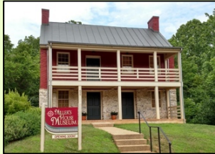
The Miller's House at Jordan's Point interprets the industrial and transportation history of the area.