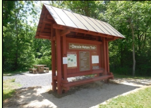
Trail information can be found at the kiosk near Mill Creek, the Lexington trailhead.