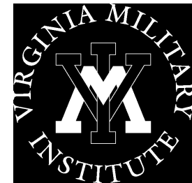
Single-Color Reversed Secondary Option