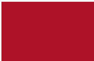
Primary Color Palette