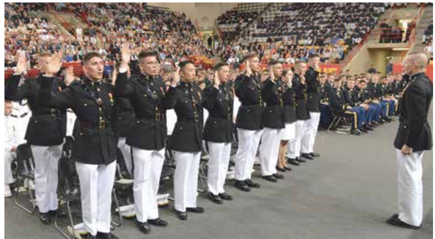
Marine Corps cadets take their oath during the Joint Commissioning Ceremony in Cameron Hall May 15. For more on commissioning, see page 9