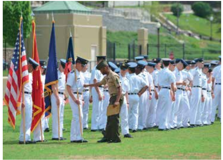
Naval ROTC cadets prepare for the battalion change of command ceremony.